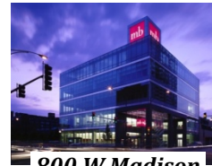
800 W Madison